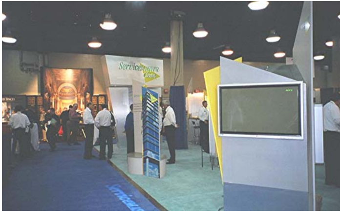
ServiceMaster Clean trade show booth at the Property Loss Research/Liability Insurance Bureau (PLRB) National Conference held in Nashville, Tennessee