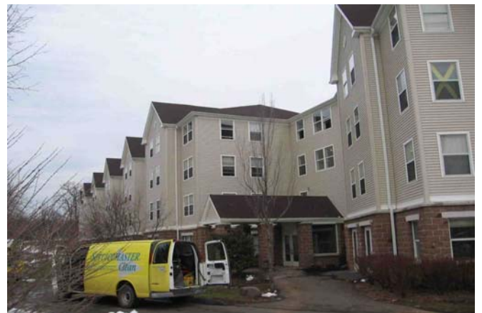
Park River Dormitory at the University of Hartford